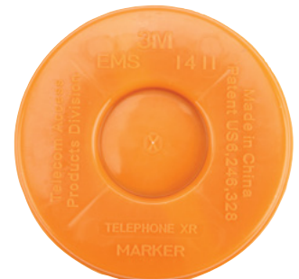
3M™ EMS Disk Marker Ideal for marking at shallow depths of 3–5'