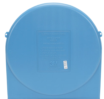
3M™ EMS Full Range Marker Suited for deep applications of up to 8–9'