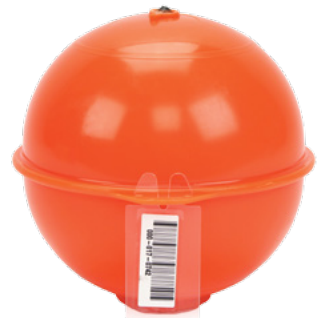
3M™ EMS Ball Marker Self leveling feature, suited for depths of 5–6'