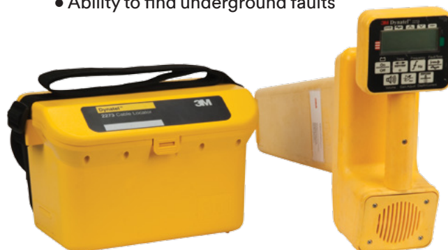
3M™ Dynatel™ Locator Features by Model