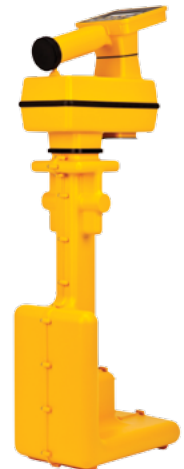
3M™ Dynatel™ iD Marker/EMS Tape Locator 7420