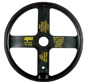
3M™ EMS Mini-Marker Designed for maintaining a stable position after placement at depths of 6'